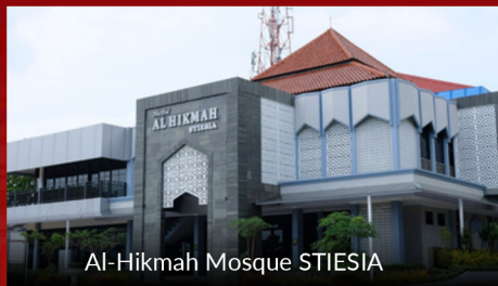
Al-Hikmah Mosque STIESIA