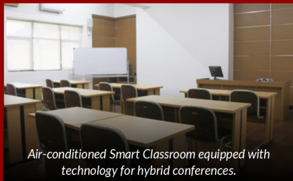
Air-conditioned Smart Classroom equipped with technology for hybrid conferences.