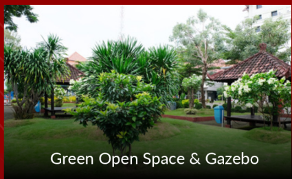
Green Open Space & Gazebo