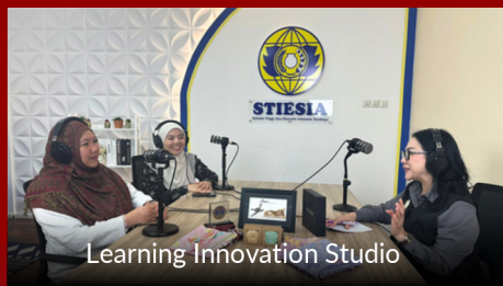
Learning Innovation Studio