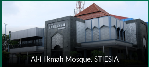
Al-Hikmah Mosque, STIESIA