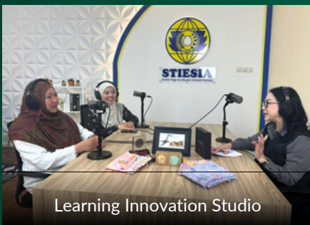
Learning Innovation Studio