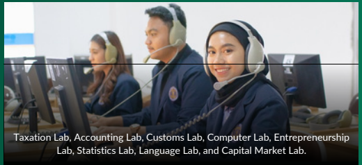
Taxation Lab, Accounting Lab, Customs Lab, Computer Lab, Entrepreneurship Lab, Statistics Lab, Language Lab, and Capital Market Lab.